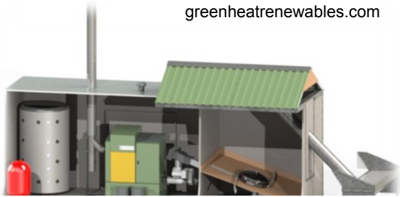
Example of a small-scale wood chip boiler system